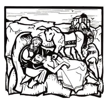
Sunday, November 12 24<sup>th</sup> Sunday after Pentecost