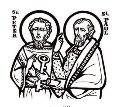
June 29 Feast of Ss. Peter & Paul