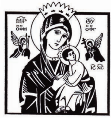
Sunday, July 2 Feast of Our Mother of Perpetual Help