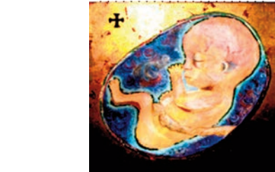
Icon of Unborn Jesus by Maja - used with permission