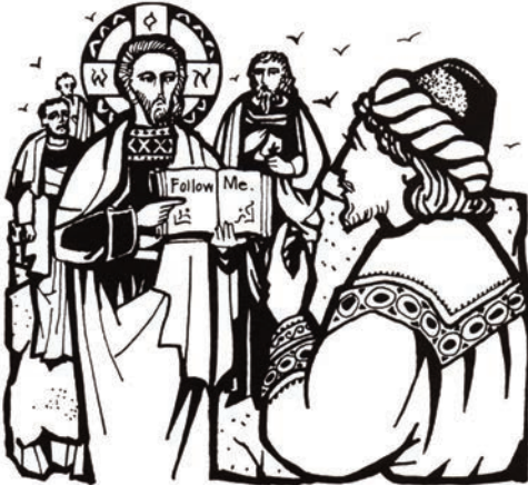
12 th Sunday after Pentecost