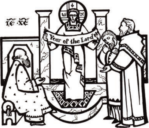
New Ecclesiastical Year

The parish community of St. Mary's extends a warm Welcome - Вітаємо to everyone who is with us today, especially all visitors. We are pleased that you have come to pray with us this Sunday. May the Lord bless You.