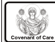
Covenant of Care

Clergy, religious and laity from throughout the Eparchy are invited to come and celebrate with us!