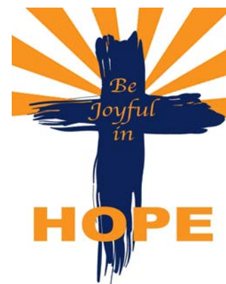
Catholic Education Week

Every year, forty days after Easter on Ascension Thursday, Catholics across the globe celebrate World Catholic Education Day. On that day, and throughout the week in Saskatchewan, Catholics take a moment to pause, reflect, give thanks, and pray for the gift of Catholic Education. This year's theme, "Be Joyful in Hope," calls us to think of hope as an action rather than a feeling. It is through hope that we are able to express the love in which we are created. Students and staff in our Catholic schools will reflect on what hope is and on how to be joyful in hope in ourselves, our families, our schools, and in all of creation. On World Catholic Education Day, May 10th, there will be a special focus on being joyful in hope in our school communities, which is especially fitting during these challenging times for Catholic Education. Please pray for our Catholic schools, that they may always be places where all who enter can truly experience joy and hope.